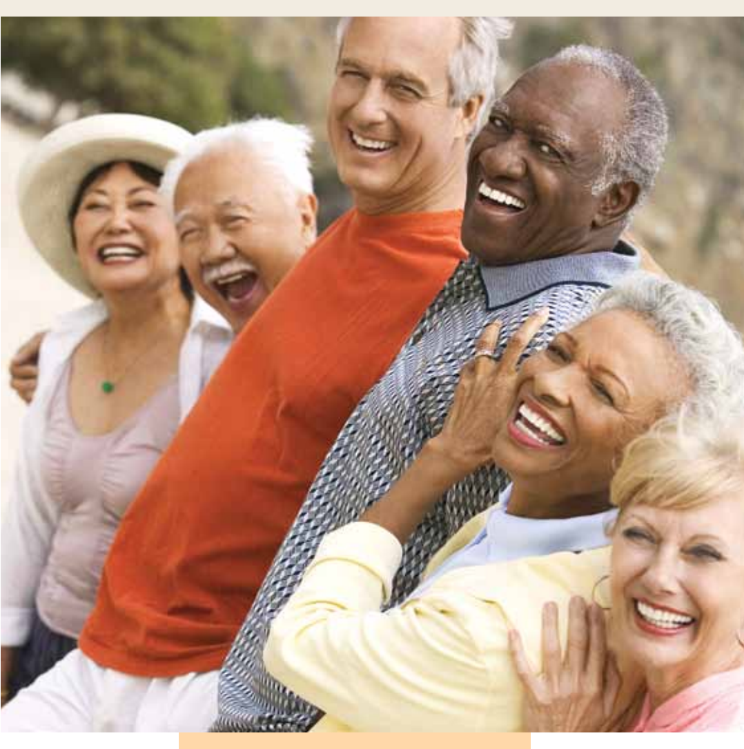
By the Editors of Kiplinger's Personal Finance