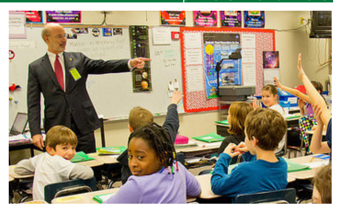
Governor Wolf's "Schools That Teach Tour" stops at Ebenezer Elementary School in Lebanon County

"Financial education plays a critical role in the security and stability of all Pennsylvanians," Wolf said. "The efforts of institutions and agencies in improving